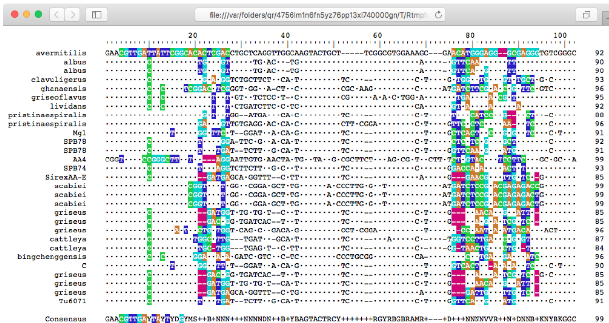
Figure 2: Amplicon with the target site for each primer colored

> BrowseSeqs(amplicon, colorPatterns=c(4, 27, 76, 94), highlight=1)