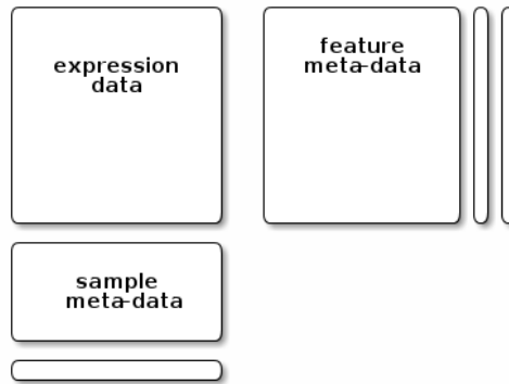
Figure 3: Dimension requirements for the respective expression, feature and sample meta-data slots.

create the expression data, while the others are used as feature meta-data. ecol can be a character with the respective column labels or a numeric with their indices. In the former case, it is important to make sure that the names match exactly. Special characters like '-' or '(' will be transformed by R into '.' when the csv file is read in. Optionally, one can also specify a column to be used as feature names. Note that these must be unique to guarantee the final object validity.