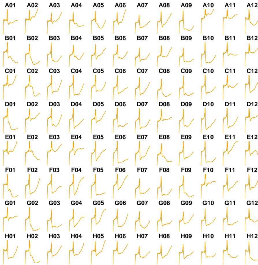
Figure 3: Plate view of a 96-well E-plate from a RTCA assay run.